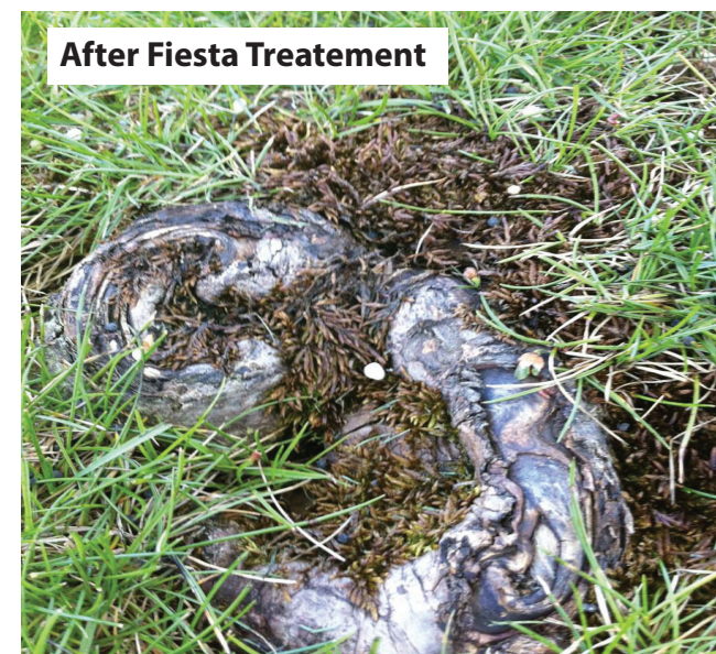
After Fiesta Treatment