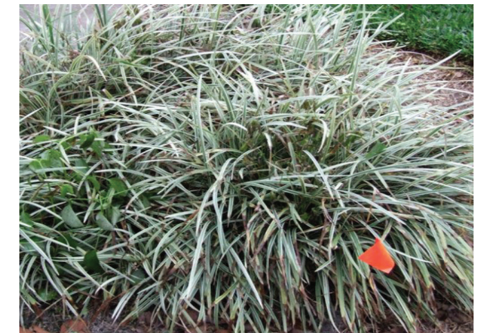
Liriope with Cuban Purple Woodsorrel was treated (flagged area) with Fiesta 5 oz per gallon (w/ NIS) ... Photo taken 2 days after treatment.