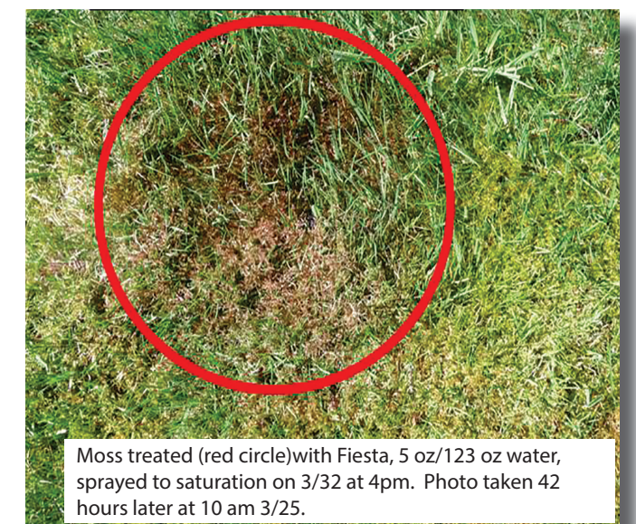
Moss treated (red circle) with Fiesta, 5 oz/123 oz water, sprayed to saturation on 3/32 at 4pm. Photo taken 42 hours later at 10 am 3/25.