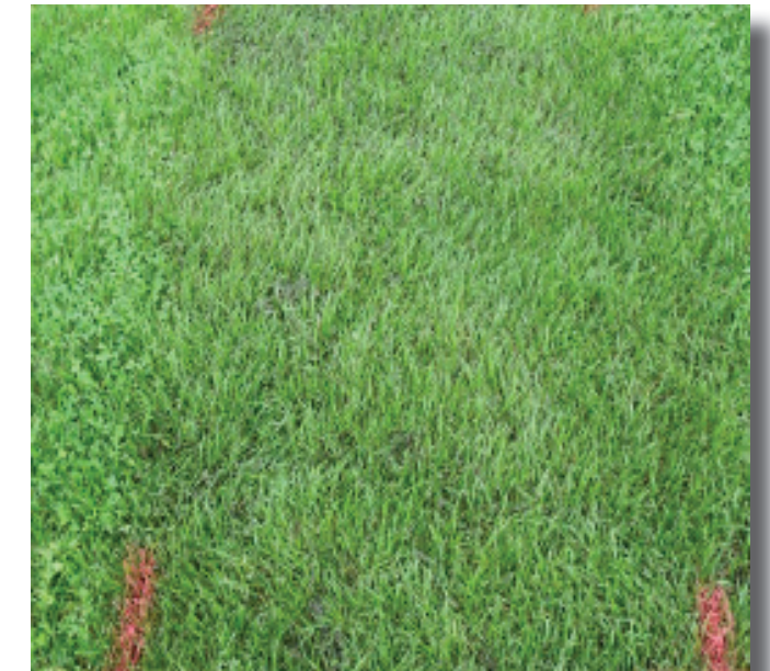
Ohio State University (David Gardner) test plot. Photo on the left is before treatment and photo on the right is one day after a Fiesta® treatment.